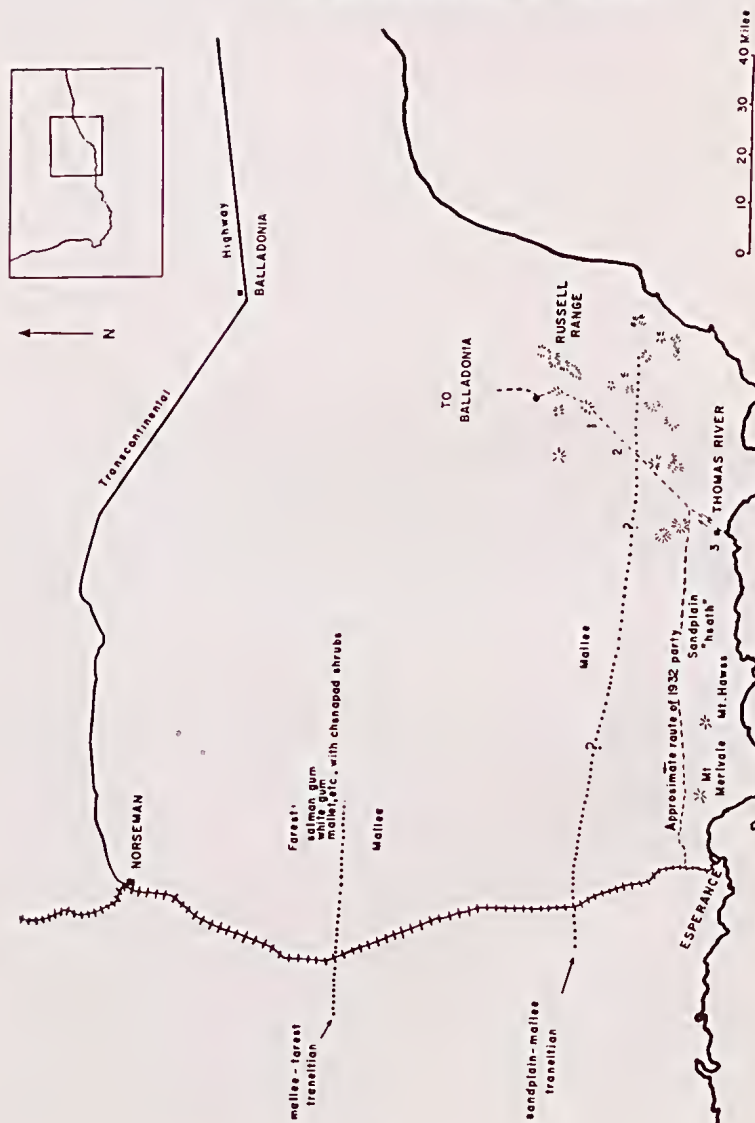
Fig. 3.—Map of the Esperance-Norseman-Balladonia area of Western Australia, showing the route taken by the party that collected Nothomyrmecia originally while travelling from Balladonia to Esperance via Thomas River. Stops were made at Mt. Ragged (1), at "Goorra" (2), and at the abandoned Thomas River Station (3). The locality of collection along this route was not recorded.